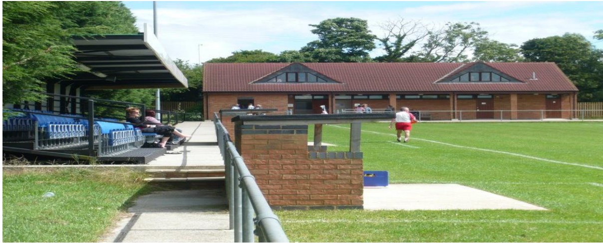
Stand & Pavilion