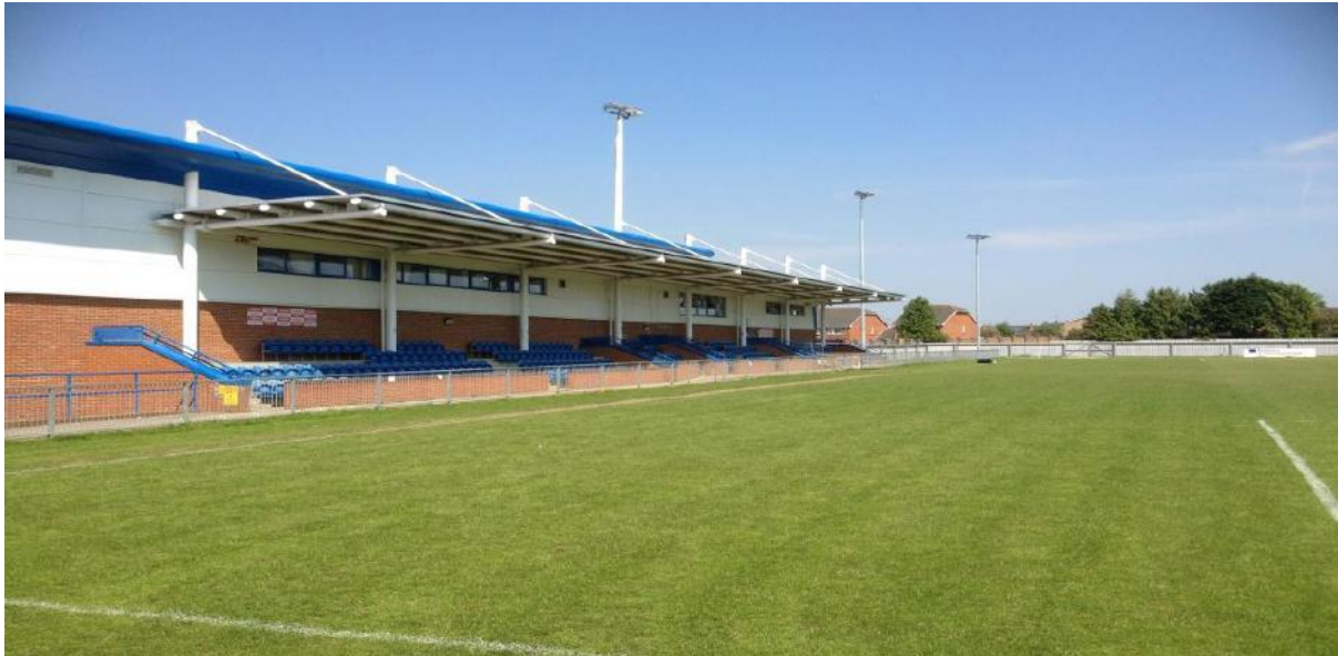
The new Stand at The Gore Ground

Follow this road through the traffic lights, under the railway bridge, over the double mini roundabouts passing the petrol station on your right, past the Brickmakers Arms on the right, past The Pheasant pub on your left, straight through the double roundabouts and then fork right into Wymers Wood Road. Look for the sign Pines Hotel. The entrance to the ground is 50 yards on the right after turning into Wymers Wood Road.