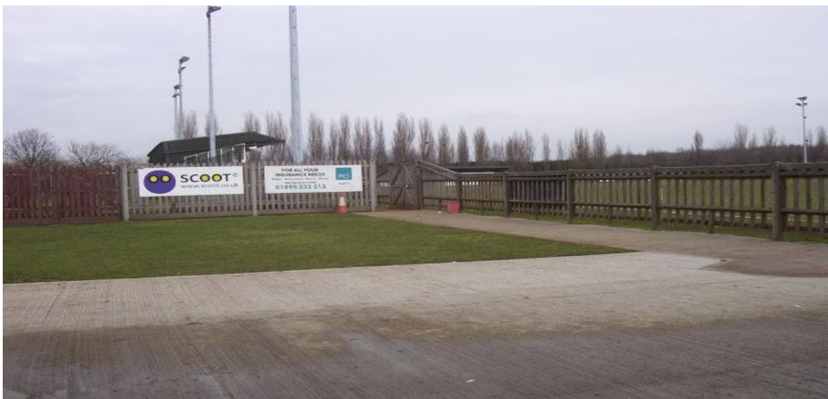
Russ Wycombe Wanderers

Train to West Drayton Railway Station then a short walk then From Stance E take the London Transport 350 bus to Horton Close walk back and take a right and follow the road to the ground.